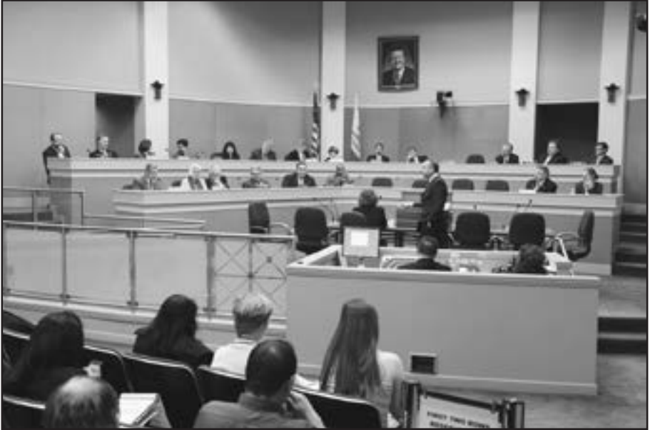
An Assembly Committee meeting in 2010.