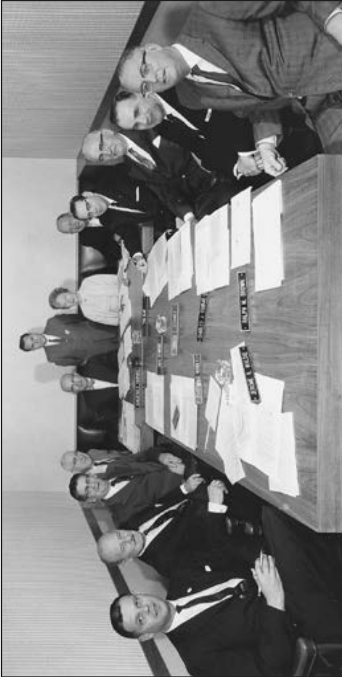
Assembly Rules Committee in 1961